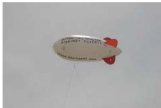
Start of the GCAP campaign at the 2005 World Social Forum in Porto Allegre

Since its inauguration, GPF Europe has been actively working with the international network 'Social Watch'. Social Watch is a network comprised of over 400 groups and NGOs, predominantly from the Global South, who deal with the fight against poverty and social justice issues. An important product of the network is the annual Social Watch Report, which is viewed by many as civil society's shadow report to the international development reports of the World Bank and the UN. As a member of the